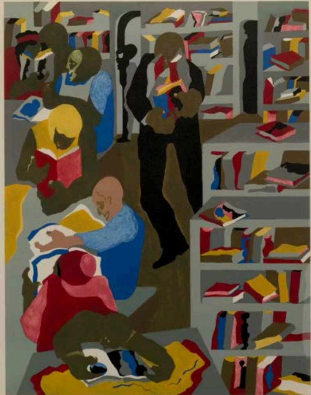
Jacob Lawrence, The Schomburg Library, 1986–1987. Serigraph. Collection of The Studio Museum in Harlem.