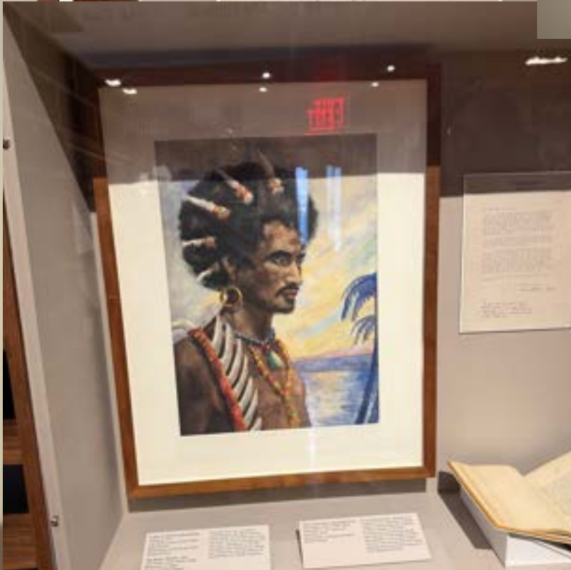
Brooklyn, NY, 1960