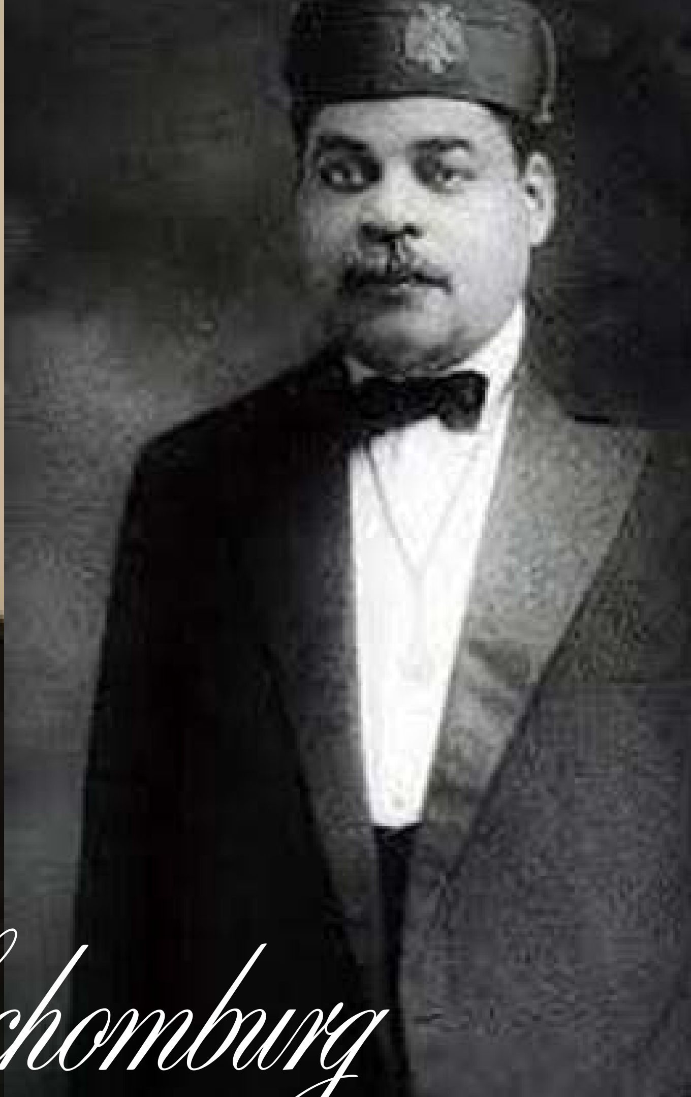
Arturo Alfonso Schomburg