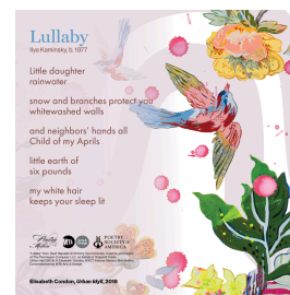
“Lullaby,” by Ilya Kaminsky Art by Elisabeth Condon