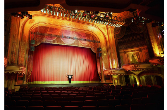
Broadway Shows - Richard Rodgers Theater