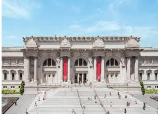
The Metropolitan Museum of Art