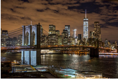
Brooklyn Bridge: Connects Brooklyn and Manhattan