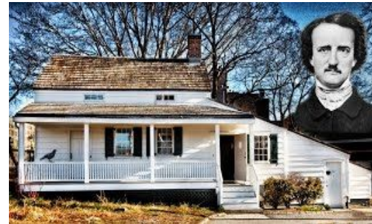
Edgar Allan Poe Cottage