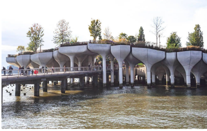
Little Island at Pier 55