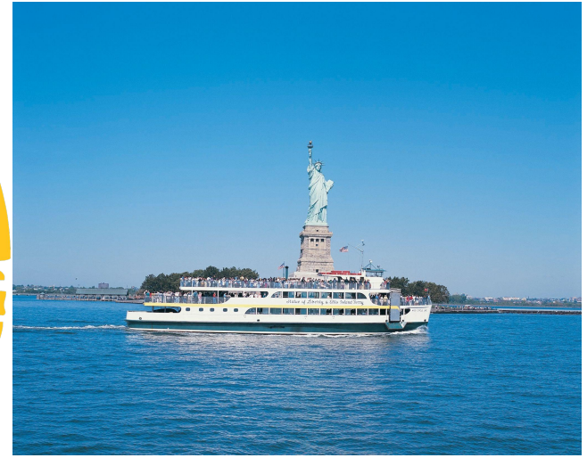
Staten Island Ferry