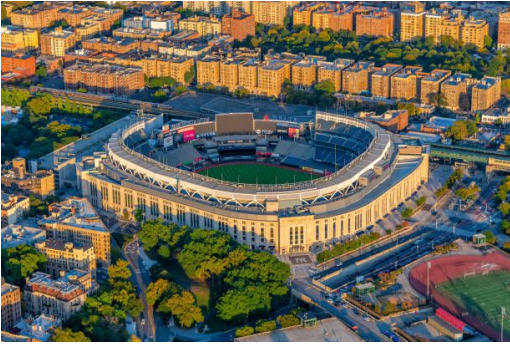
Yankee Stadium: Home of the Bronx Bombers