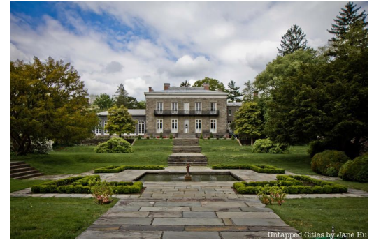
Pelham Bay Park