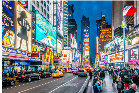
Times Square - Billboards