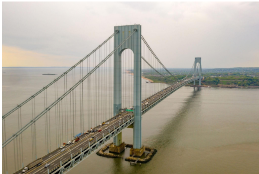
Verrazano-Narrows Bridge: Connects Brooklyn and Staten Island