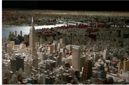
Panorama of the City of New York