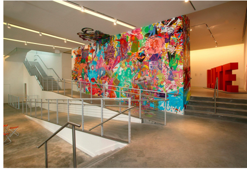
Bronx Museum of the Arts