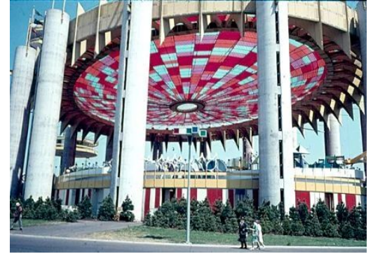
New York State Pavilion