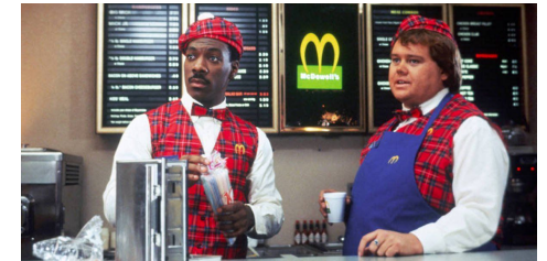
Eddie Murphy's "Coming to America"