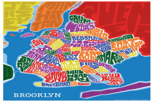
Neighborhoods of Brooklyn