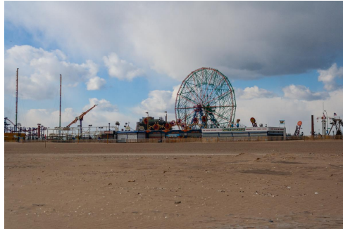
Coney Island Beach