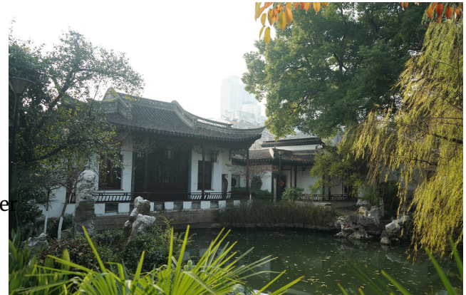
Snug Harbor Cultural Center & Botanical Garden