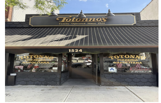
Totonno's Pizzeria: Oldest in Brooklyn, coal fired brick oven