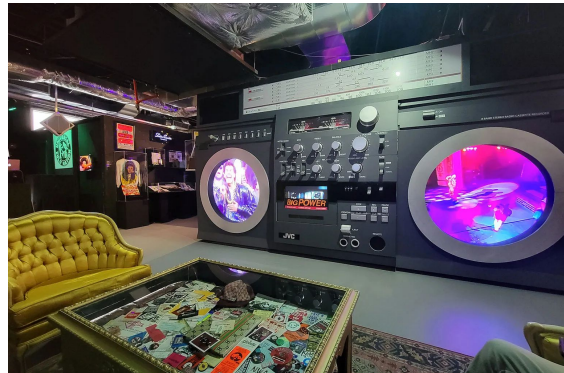
NYC Hip Hop Museum