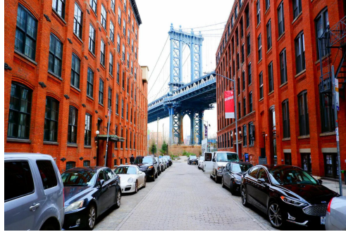
Dumbo: Neighborhood under the Manhattan Bridge shows the Industrial Past