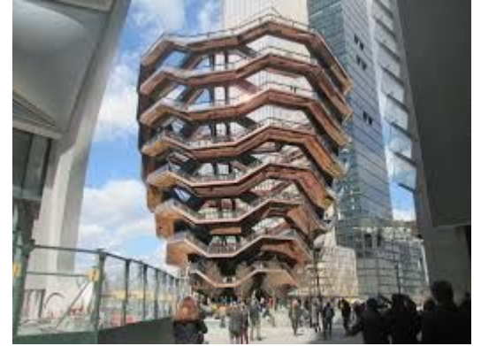
Vessel - an interactive public art piece